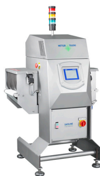
AdvanCheK AdvanCheK Plus