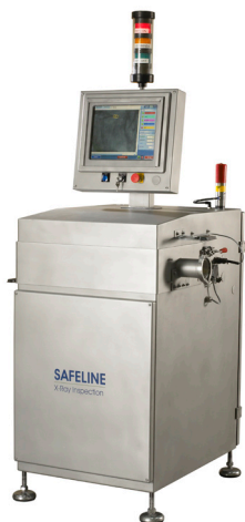
InspireX R70 Pipeline